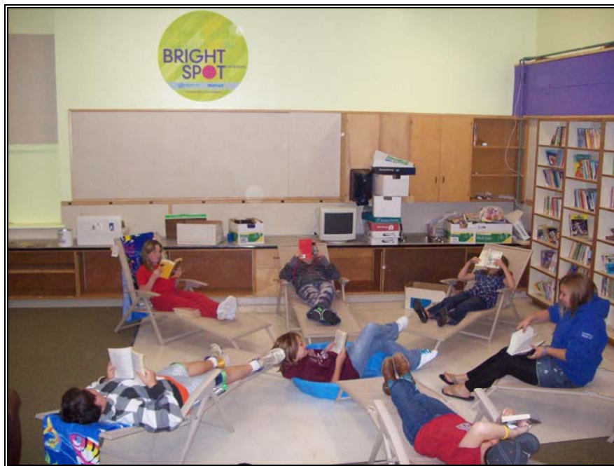
HELP Committee and Boys & Girls Club of the Hi-Line “chillaxing” on lounge chairs and reading in their Bright Spot

Members who otherwise show little interest in traditional reading materials readily follow the book reviews and polls online. The exchanges on myclubmylife.com encourage a lively teen culture in the safe space of the Club. Teens review books, and they solicit reviews not only from their peers, but from celebrities like former NFL coach Tony Dungy, and other BGCA Youth of the Year. This sense of ownership and uniqueness has increased the appeal of the Club for teens. As the Boys & Girls Clubs of Metropolitan Phoenix coordinator describes the effect, “We are developing group solidarity.”