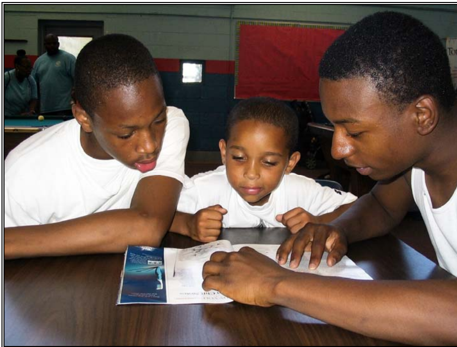
Older members of the Boys & Girls Clubs of Chattanooga, East Lake Unit read to a younger Club member

As the staff of the Bellingham Unit of Boys & Girls Clubs of Whatcom County report, when younger members see the tweens and teens reading in the Bright Spot, they are impressed. The staff encouraged the creation of Reading Partners, where a young member partners with a teen in a challenge to see who can get through a book first as they take turns alternating pages and chapters.