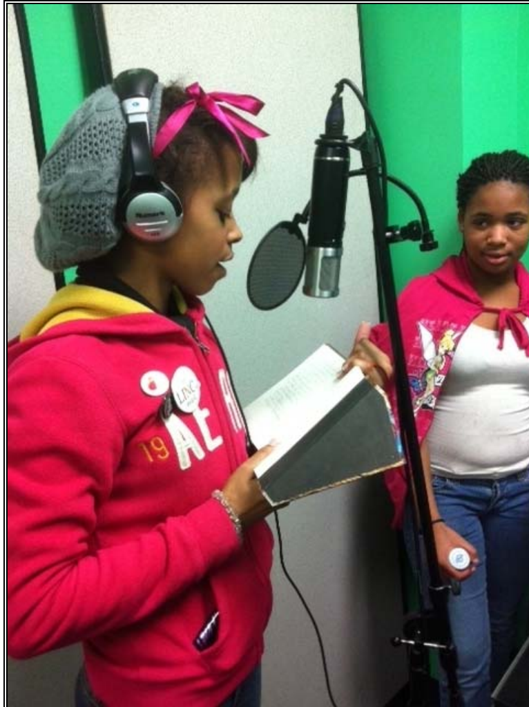
Members of Boys & Girls Clubs of Dorchester, Inc. recording a podcast

Reading enrichment opportunities in out-of-school time through the Club can nurture and provide a context for academic performance without being “school after school.” Podcasts, myclubmylife.com online reviews and video testimonials powerfully connect our teens to the joys of literacy.