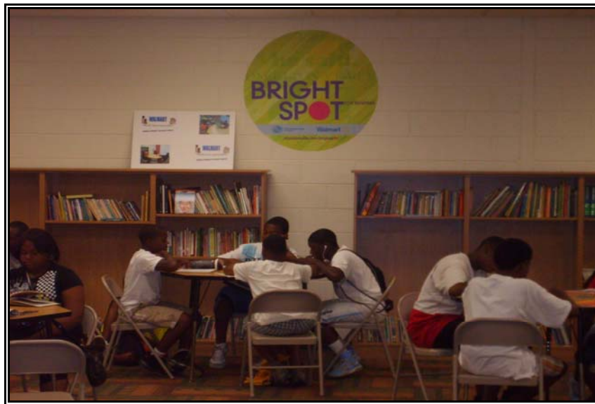
Club members read together at the Bright Spot of their local library

The public library launched the Bright Spot for Reading initiative in partnership with the Jefferson Unit of Boys & Girls Club of Jackson County, Inc. by presenting and discussing books about their native northeast Georgia area and books by local authors. The first book they read, The Tree That Owns Itself: And Other Adventure Tales From Out of the Past , was by a local author. The members were thrilled to see so many books about places and things they were already familiar with.