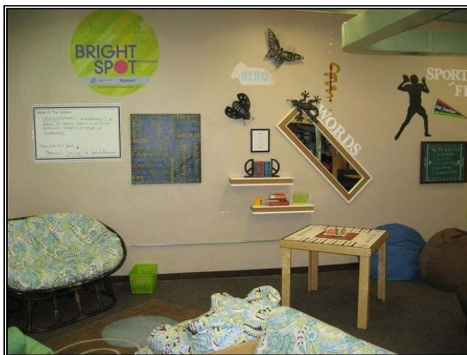
The Bright Spot for Reading at the Eielson Air Force Base Youth Center

One of the critical components of a Bright Spot for reading is building the reading collection. This may be based on a formal survey as recommended by the Boys & Girls Club of Souhegan Valley. Their survey solicited responses to genres of books such as classical literature, young adult series and self-help books. Club staff also maintained a suggestion box to regularly collect teen input. They also gathered recommendations for furniture to decorate the space, which included soft and movable pieces like bean bags, futons, beach chairs and large pillows, all of which could withstand teen abuse.